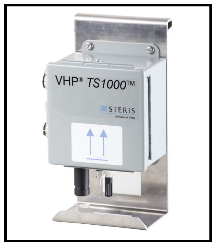
(Typical only - some details may vary.)